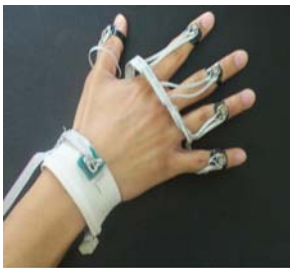
Figure 1 The AcceleGlove

The AcceleGlove is a set of six dual-axis accelerometers, mounted on the fingers and the back of the palm, that report position with respect to the gravitational vector. Sensors are placed on the back of the middle phalanges, on the back of the distal phalange of the thumb, and on the back of the palm [figure 1]. To determine postures using this arrangement, we tested the 26 letters of the ASL alphabet until ambiguity was eliminated.